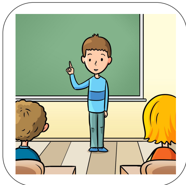
Odpowiedz przy tablicy.