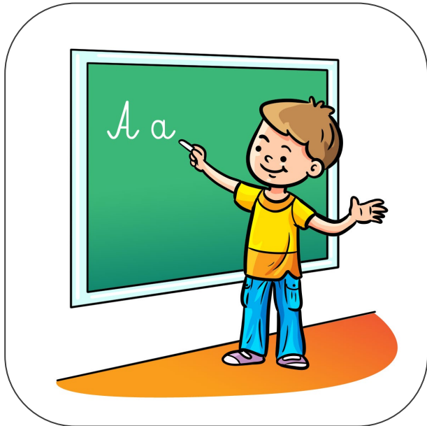
Napisz na tablicy.